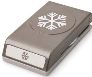
Item #119852 Snowflake Punch